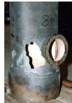
Figure 1: Damage caused by thermo-acoustic instabilities.

As it stands, thermo-acoustic instabilities are dealt with as and when it happens using a trial-and-error approach. The aim of the project is to predict whether an oscillation will grow or not, and if so, systematically guide the burner design to a stable point.