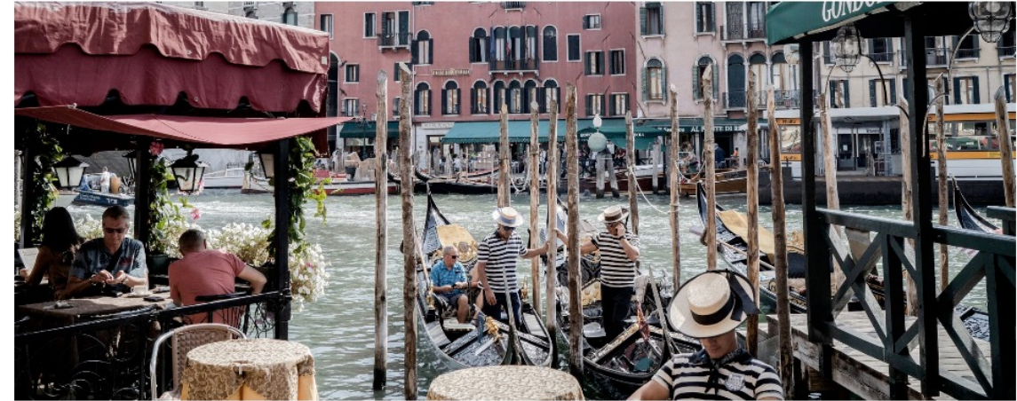
A view of the Grand Canal in Venice.