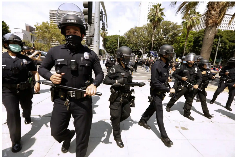
▲ Los Angeles police officers survey a protest in downtown Los Angeles on 14 August.

An internal police chief memo shows employees were directed to use 'field interview cards' which would then be reviewed