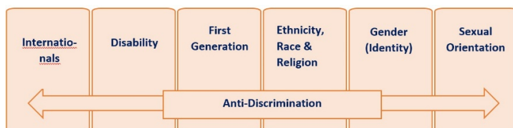
Figure 2: SEG Inclusion focus themes

First we need to understand where the biggest obstacles are that need to be resolved in order to create an inclusive university. Figuring these out allows us to identify the “low hanging fruit”. This will enable us to work on issues directly and swiftly that create more visibility for D&I issues. The UT is a diverse environment with many dimensions. Through in-depth conversations and by working together closely with the Shaping Expert Group (SEG) Inclusion, 6 themes so far have been decided upon. We believe that immediate action on these themes needs to be taken for the UT to be seen to work towards a more inclusive community.