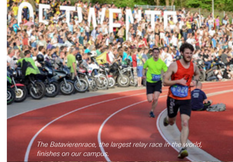
The Batavierenrace, the largest relay race in the world, finishes on our campus.

A striking element of student life in Enschede is the presence of study, sports, cultural, social, and