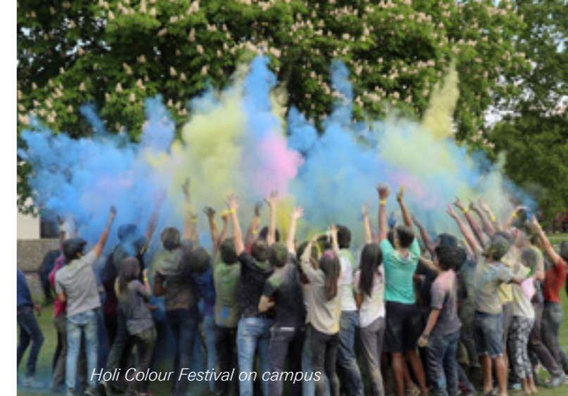
Holi Colour Festival on campus

international associations. Joining an association will support you with everyday situations and help you settle in and make friends. But first, you start your student life with the introduction week 'The Kick-In': the absolute best way to meet other students and explore the campus and all other aspects of your future student life!