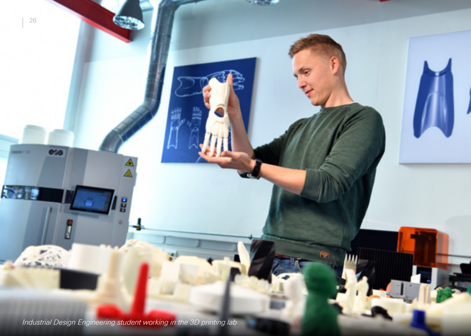
Industrial Design Engineering student working in the 3D printing lab