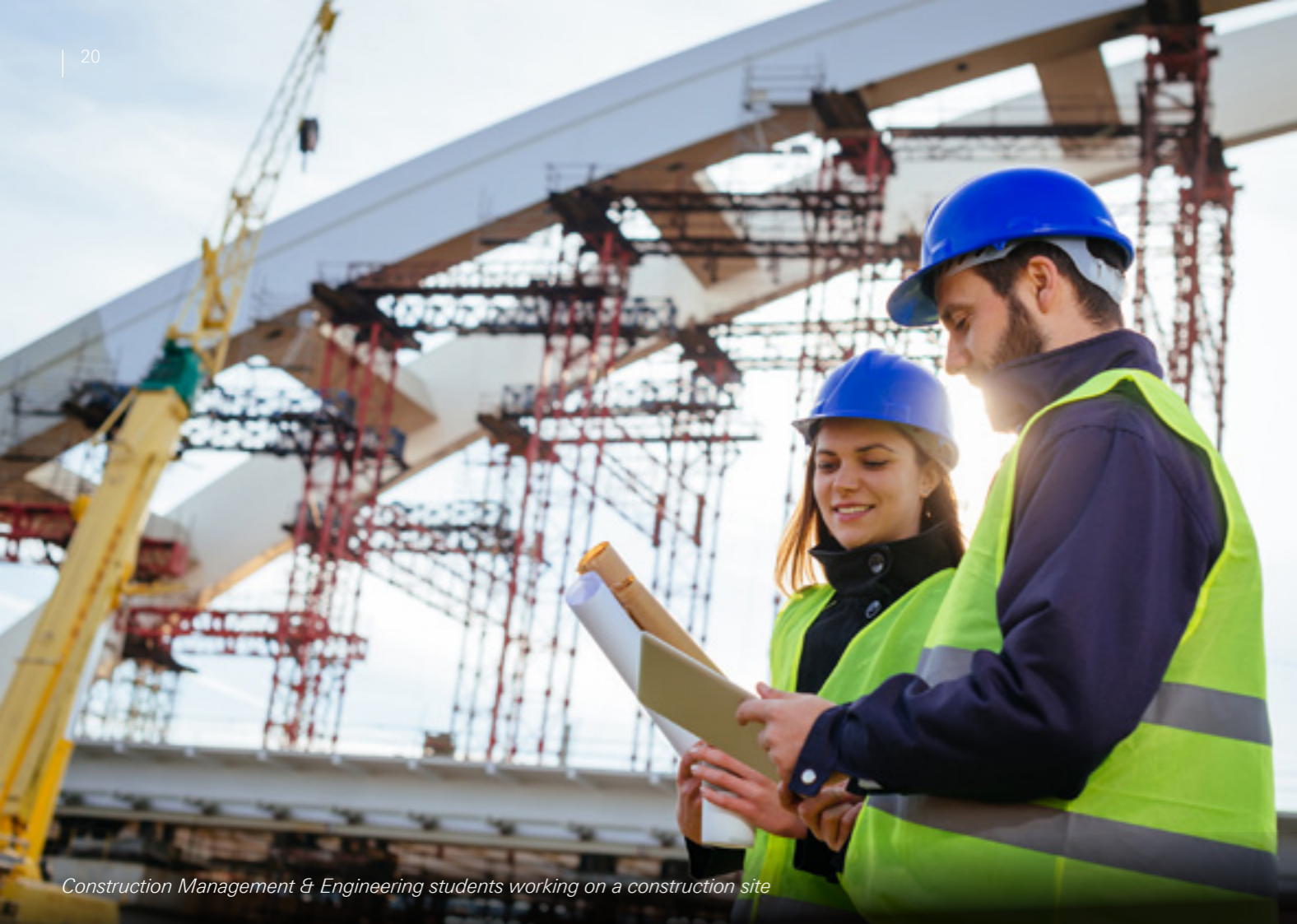
Construction Management & Engineering students working on a construction site