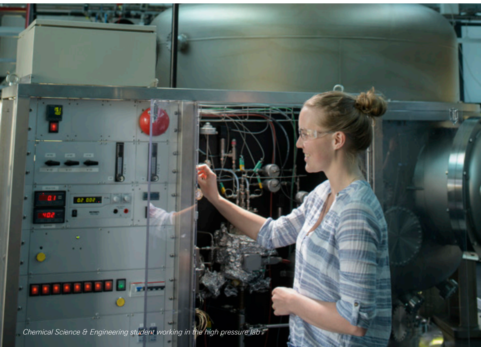
Chemical Science & Engineering student working in the high pressure lab