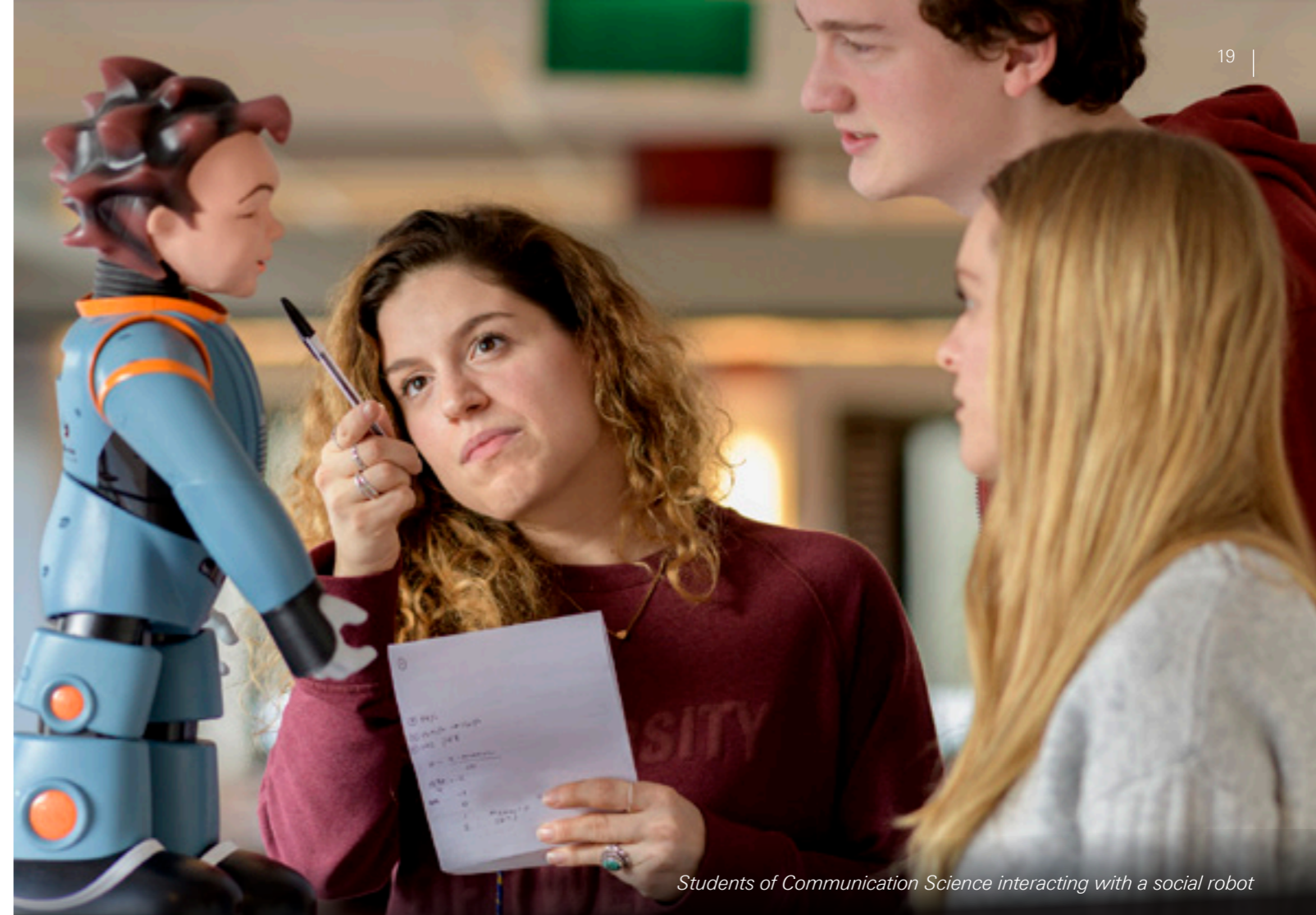
Students of Communication Science interacting with a social robot