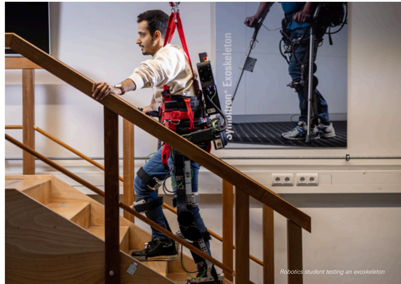
Robotics student testing an exoskeleton