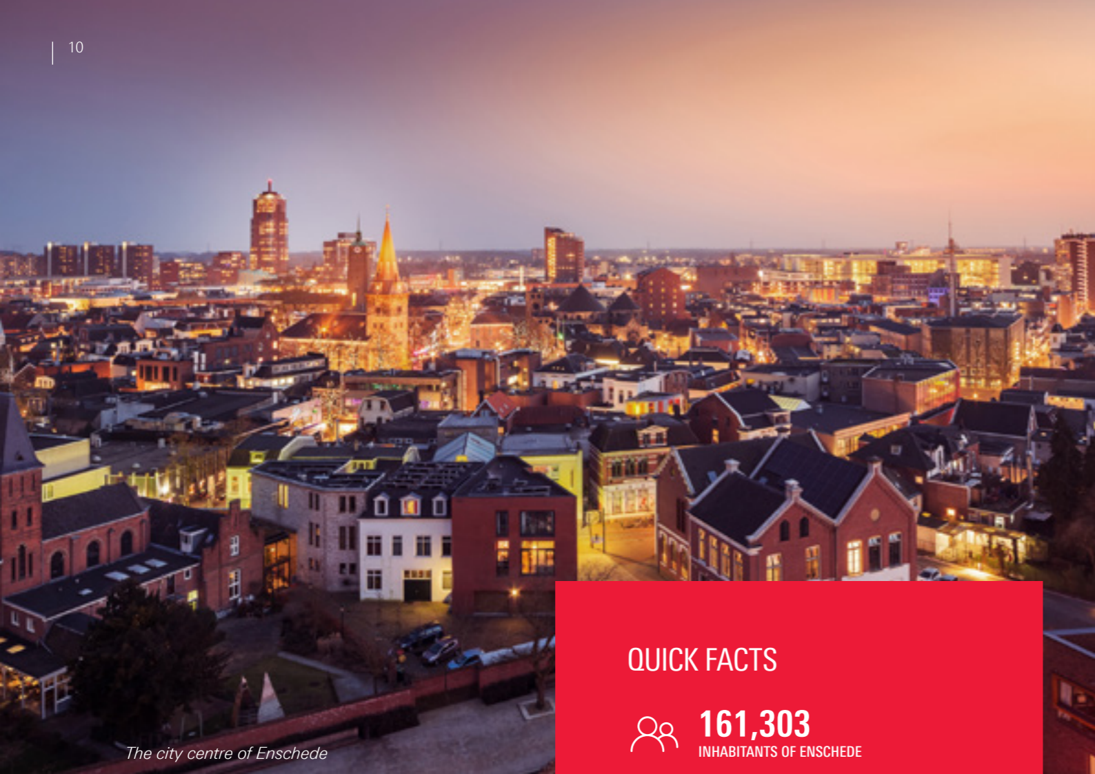
The city centre of Enschede