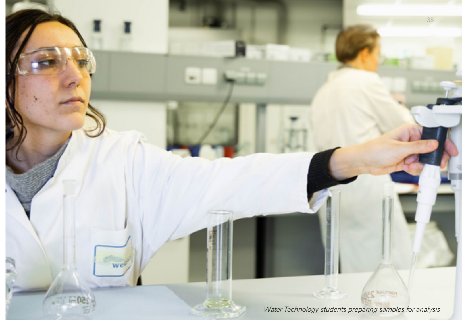
Water Technology students preparing samples for analysis