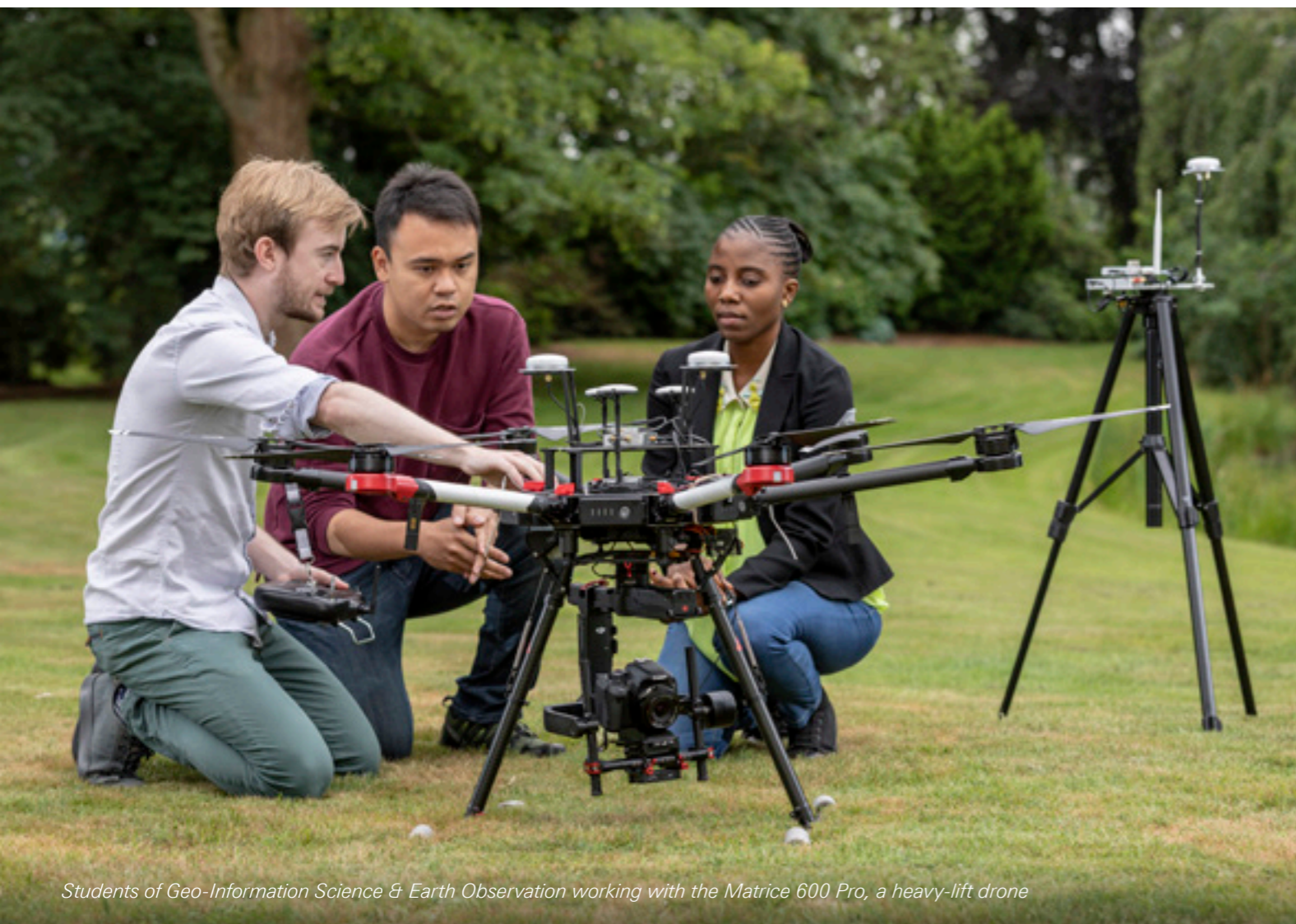
Students of Geo-Information Science & Earth Observation working with the Matrice 600 Pro, a heavy-lift drone