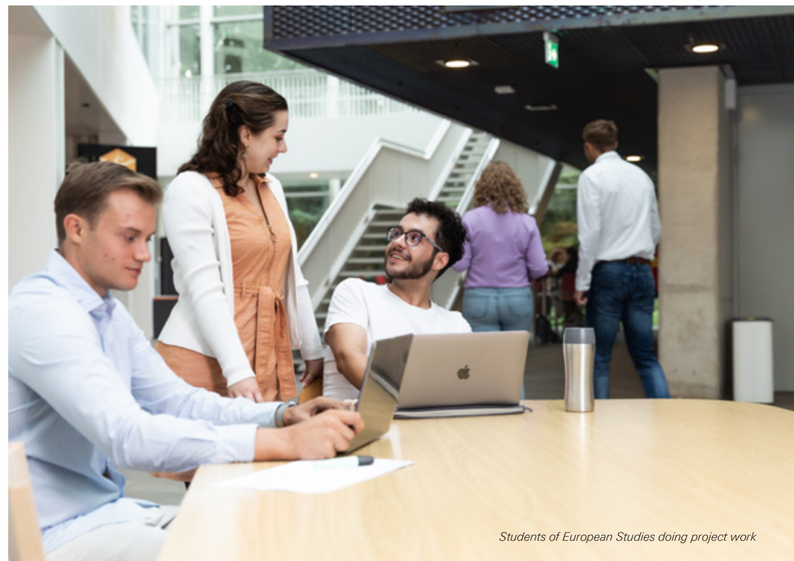
Students of European Studies doing project work