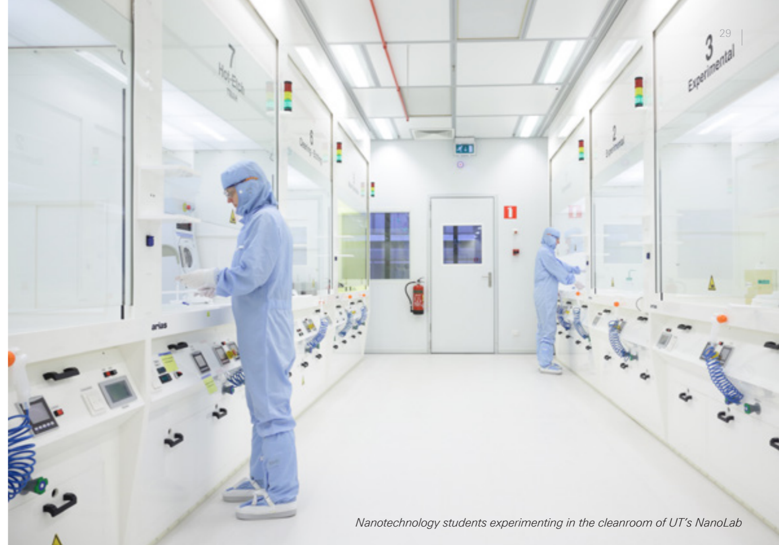
Nanotechnology students experimenting in the cleanroom of UT's NanoLab