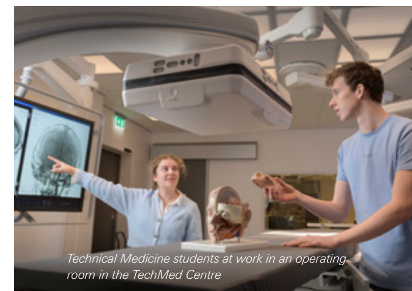
Technical Medicine students at work in an operating room in the TechMed Centre

We know that problems cannot be solved with one discipline. That is why we highly value interdisciplinary collaboration. At UT, you will not only be able to gain in-depth expertise and become