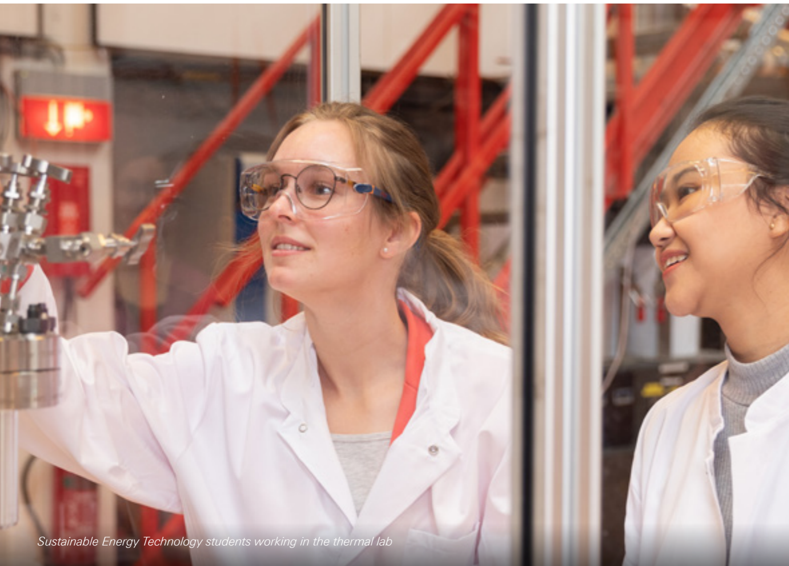
Sustainable Energy Technology students working in the thermal lab