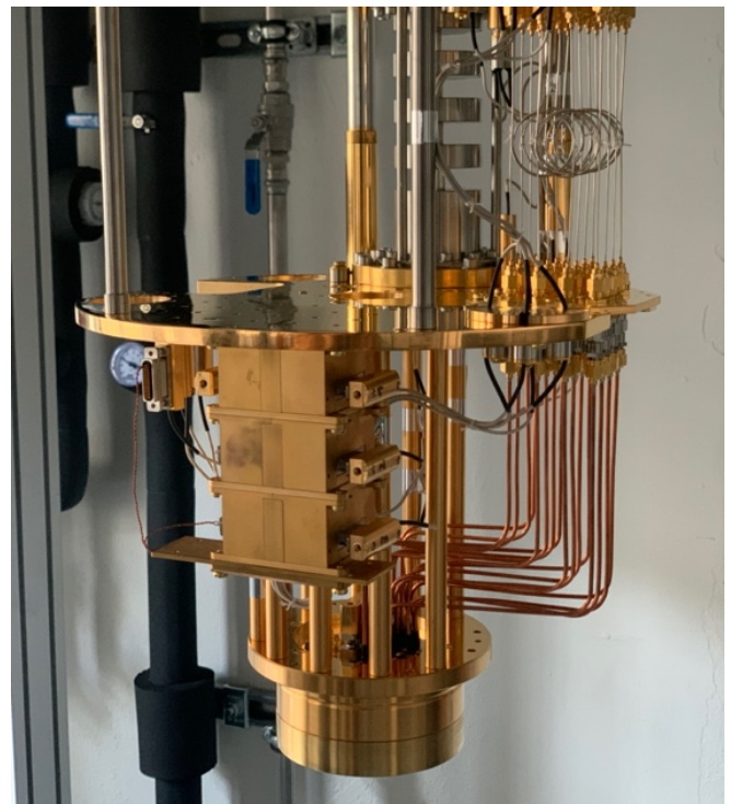
Three stacked MFT filter boxes under test in a cryo-free dilution fridge at Uni Basel.

As part of this secondment project, you will test new MFT designs in close collaboration with the Zumbühl lab team, participate in the design and production of compact MFT boxes and optimize the production process.